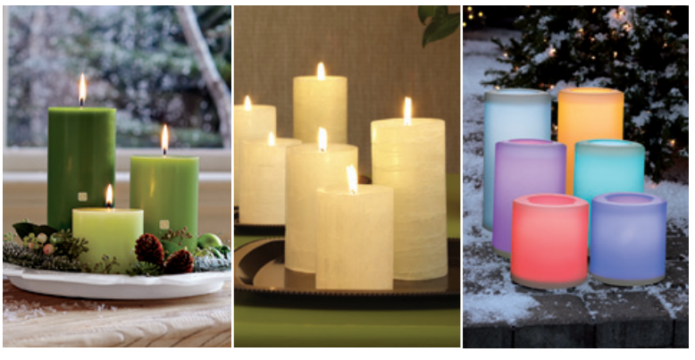
*Excludes Ebony Oud Square Pillar (K05855)