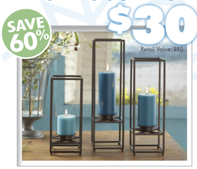
Limit one per Host.